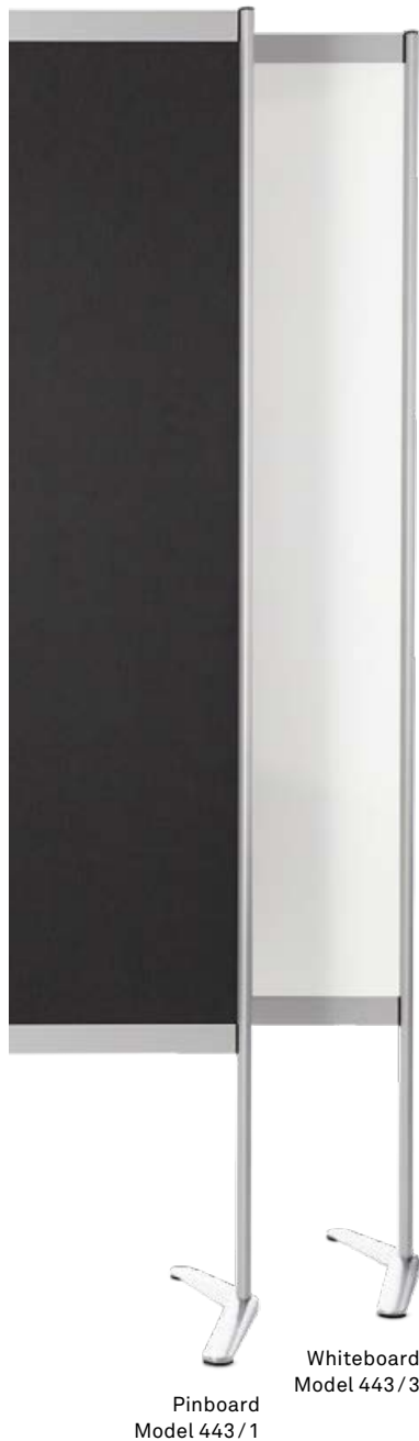
Pinboard Model 443 / 1