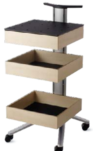
Server Model 446 / 3