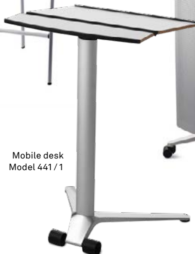
Mobile desk Model 441 / 1

The Confair range is the perfect example of image building and innovative force combined. High-quality details, excellent materials and a distinctive design boost team spirit and the impression created.