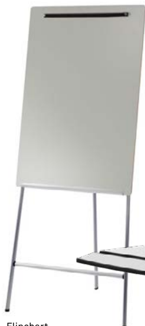
Flipchart Model 442 / 1