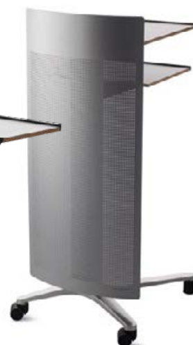
Lectern Model 448 / 9